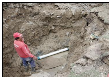
Haven Hill Irrigation repair

Do not contact WD directly as they have been instructed to respond to designated people who can effectively assess any emergency and if necessary, turn off water, pumps and/or controllers as needed.